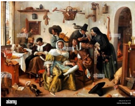
Beware of Luxury

Our topic this month was the painter Jan Steen, who lived in the Netherlands in the 17 th Century. His work was often amusing and his faces were sometimes grotesque. He resembled Bruegel in style. The talk included a short video clip (with unwanted adverts). This was particularly informative and talked about EMBLEMATA. It focussed on the painting above and warned against the ease of which wealth can be frittered away and how important it is to be careful with both money and precious things, including life!