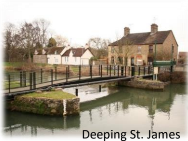
Deeping St. James